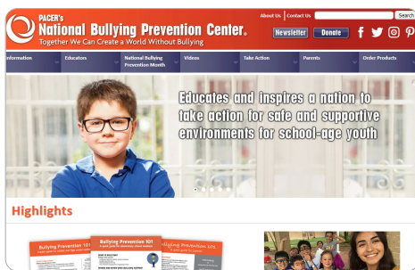
PACER.ORG/BULLYING Parents, educators, and students