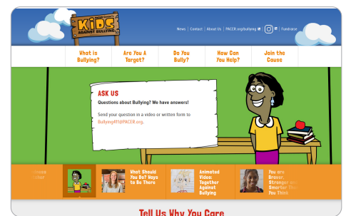
PACERKIDSAGAINSTBULLYING.ORG Elementary school students