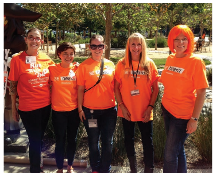
Staff at Disney's Interactive Studios get into the spirit of Unity Day.