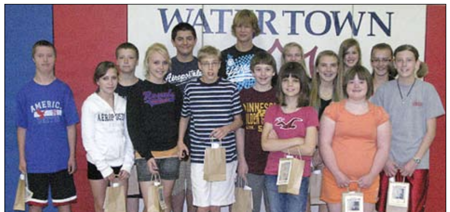
Peer advocates from Watertown-Mayer Middle School.