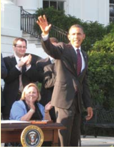
The President at the ADA ceremony.