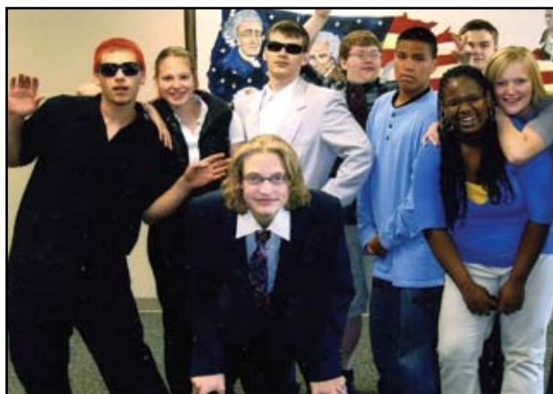
Teens from Bemidji, Minn. took part in the video project.