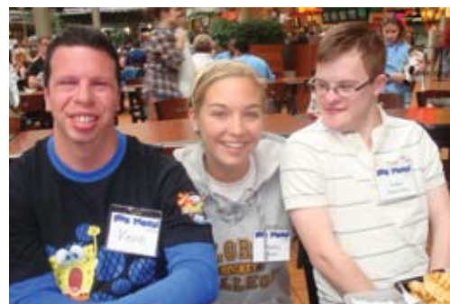
Fun Times participants having fun at the Mall of America.