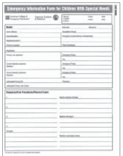
The EIF is easy to complete.

Pediatrician's Web site at www.aap.org. Give your child's physician a few weeks notice to complete the form.