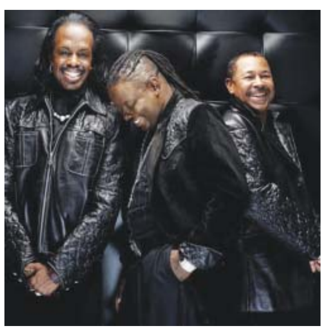
Earth, Wind & Fire

Known for its charismatic performance and positive music, Earth, Wind & Fire established a reputation as topranked musicians when its breakthrough hit, "Shining Star," topped the pop and R&B