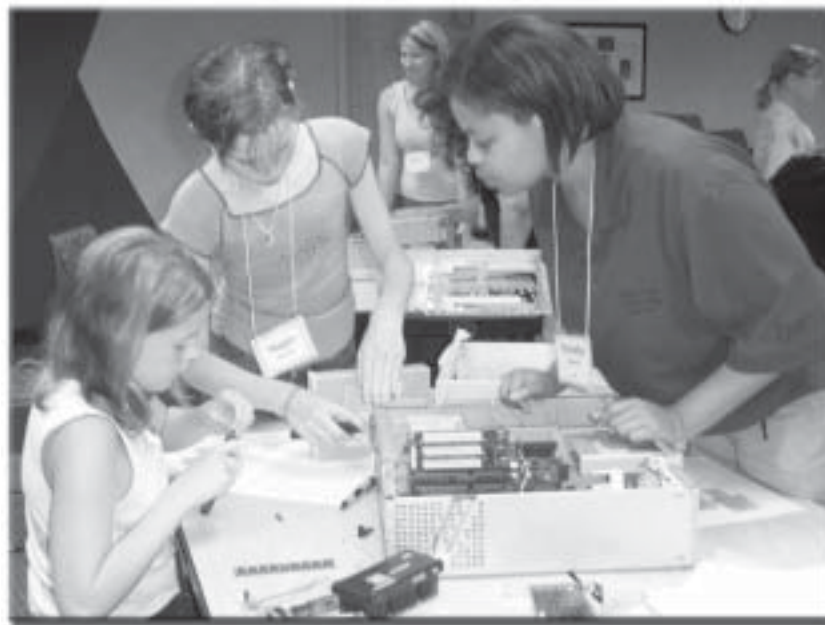
IBM selected PACER as its partner for its first EXite Camp for girls with disabilities. The girls learned about computers first hand during "PC Tear-Down" Day, the most popular activity of the camp. Please turn to page 7 for more details about EXite Camp.

Best Buy's involvement with PACER brought another important resource: Best Buy employees as volunteers. From helping assemble computers for the PACER Training Room to providing technical consultation for the national Technology Project, Best Buy's staff has been critical in helping PACER expand the benefits of technology to all parent centers across the nation. This is a highly synergistic relationship: PACER has access to expertise and resources,