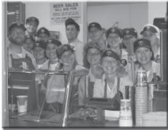
The MN Twins Games occupied Board members during this fun summer season. Friends of PACER Advisory Board members worked at the concession stands during Twins Games to raise money for PACER programs. This new activity was another fun success for PACER. Go Twins!

COUNT ME IN puppets —provides puppet shows for preschool and elementary-aged children to foster positive attitudes and acceptance of children with disabilities in their schools and communities.