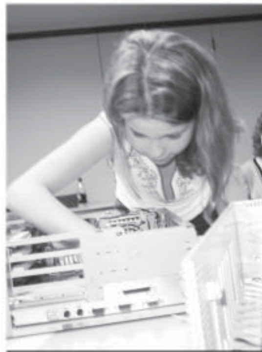
An EXite participant engaged in the tear-down activity that provided insight into how computers work.

Why focus the camp on girls with disabilities? Studies have indicated that girls in general begin to lose interest in math, science, and technology around the fifth grade and are often discouraged from pursuing technical careers. ( Tech-Savvy: Educating Girls in the New Computer Age , 2000) There is an even more significant drop for girls with disabilities in these areas, as students who need accommodations or adapted curricula often encounter difficulties having their needs met at the junior high and high school levels. ( Parent Brief on Universal Design for Learning and Transition , 2003)