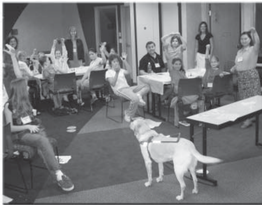
The girls created polymers during one lab session. Campers held up their finished product, "slime," and caught the attention of a volunteer IBM employee's seeing eye dog.